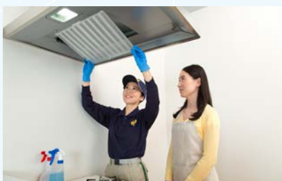
Housework support service—cleaning of a ventilation fan