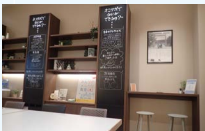
A Nekosapo Station coworking space