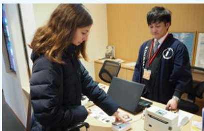
A tourist leaving her luggage at SOZORO