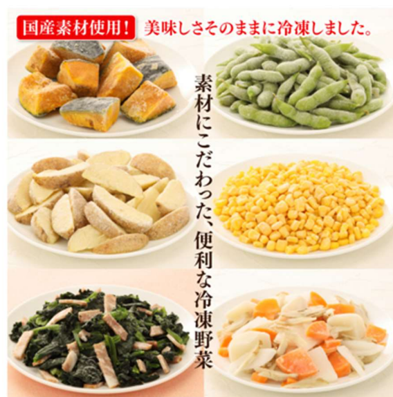
Product example ②: Frozen vegetable set

Direct Sales Division, ZEN-NOH Foods Co., Ltd. TEL: +81-3-5843-7053