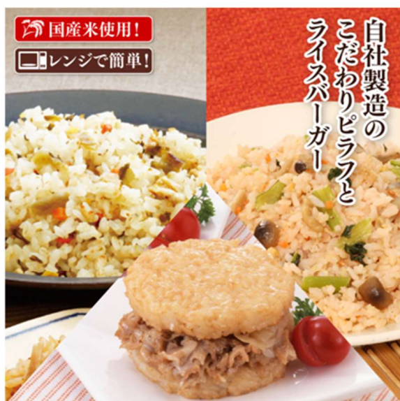
Product example ①: Frozen rice set

国産素材使用！ Made with domestically produced ingredients 美味しさそのままに冷凍しました Frozen to protect original flavor 素材にこだわった、便利な冷凍野菜 Convenient frozen vegetables made from the finest ingredients