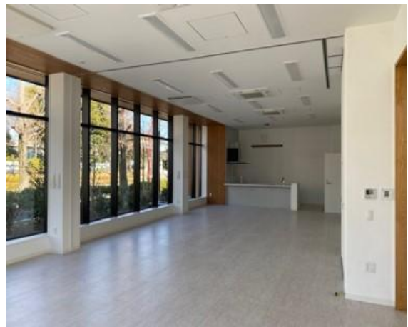
Rental community space with kitchen