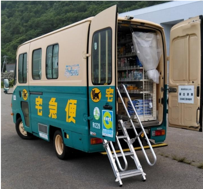
A collection and delivery vehicle converted to serve as a