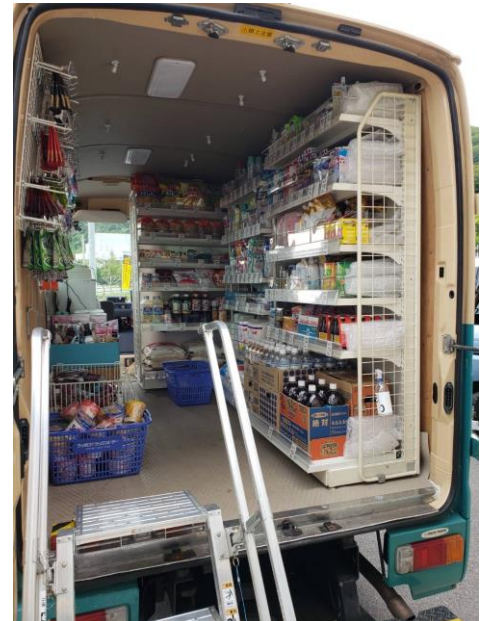
Interior of a dedicated mobile