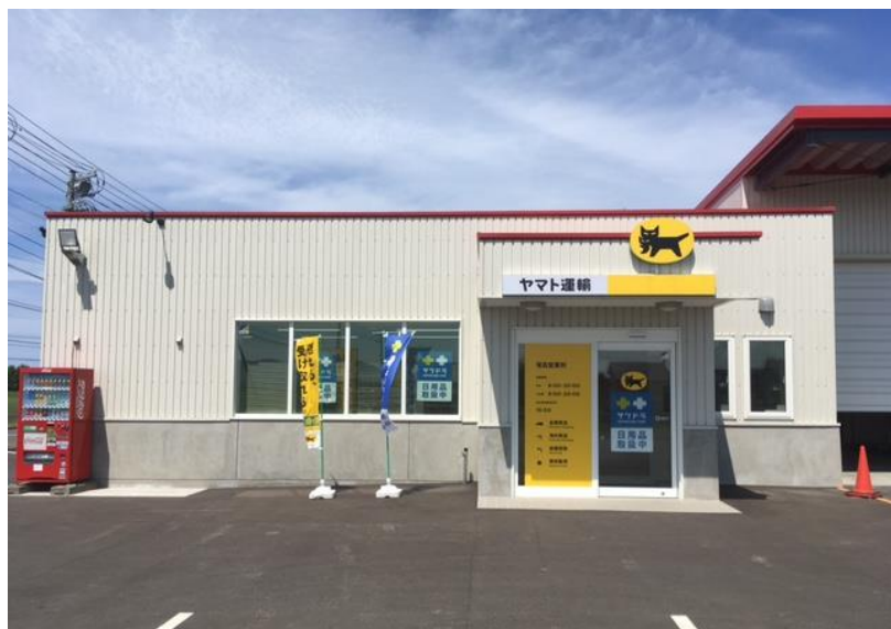
Exterior view of the Tokoro Sales

*3 Demonstration tests have been conducted at the Okushiri Sales Office (from November 2021), Hokkaido Horonobe Sales Office (from November 2022), Tokoro Sales Office (from January 2023), and Omu Sales Office (from February 2023).