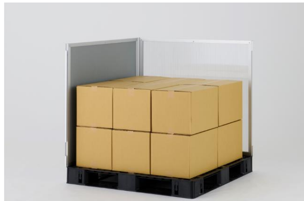
[Right Image] With half the panels removed and loaded with shipment