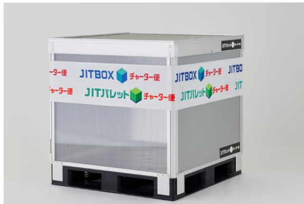
[Left Image] All panels installed