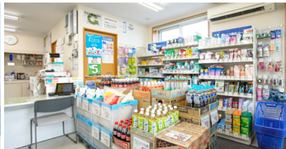
In-store sales at sales offices

• Yamato Transport press release: SATUDORA HOLDINGS and Yamato Transport Sign Basic Partnership Agreement (July 25, 2023)