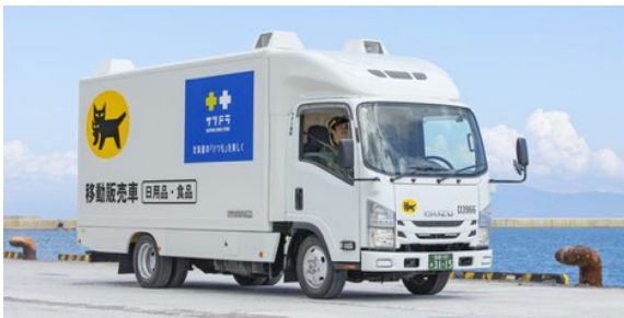
Dedicated mobile sales vehicle

May 2024: Okushiri Town, Secoma Company,Ltd., and Yamato Transport (Hakodate Regional Branch) sign an agreement on emergency supplies of daily commodities in the event of a disaster