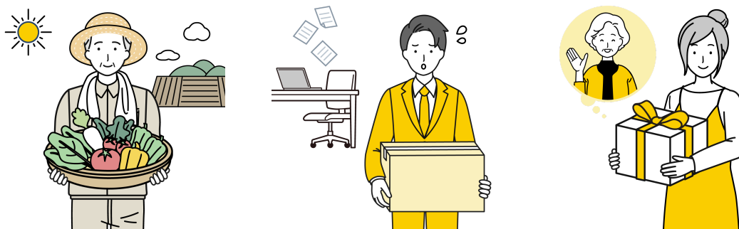
Illustration of TA-Q-BIN Same-Day Delivery Service use cases

*Shipping cutoff time varies from sales office to sales office. The delivery time slot that can be specified also depends on the delivery address. Please check the following URL for details.