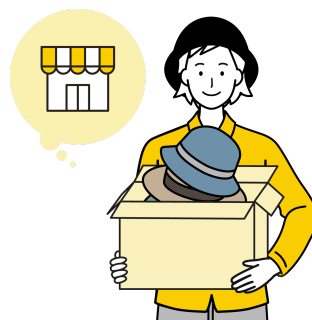
Illustration of Intraprefectural Fare use cases