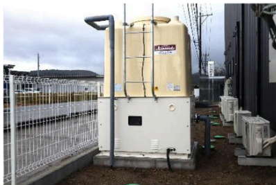
Water receiving tank and rainwater utilization system *To be installed in 2026