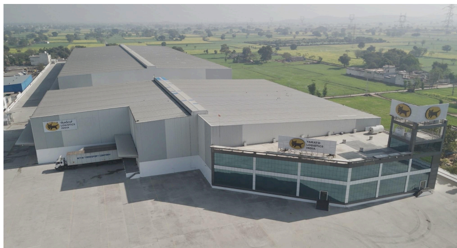
<Exterior of NH8 Logistics Center>

Taking advantage of its strategic location for both domestic and overseas logistics, the NH8 Logistics Center will offer Japanese standards high-level of contract logistics *1 (hereinafter referred to as CL) service. This will provide optimal logistics solutions to meet the needs of manufacturing customers aiming to expand production in India and emerging countries in the Middle East and Africa. YLI will contribute to solving issues throughout the global supply chain by leveraging its expertise in high-quality CL service know-how it has cultivated over many years with Japanese manufacturing customers and by utilizing its global network.