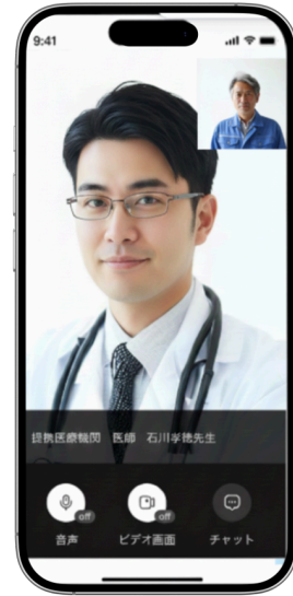
(4) Online checkup