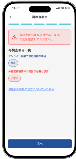
(2) Automatic determination of reexamination need