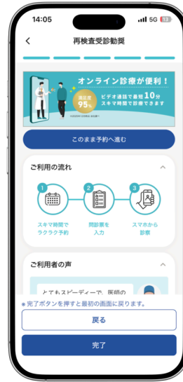
(3) Recommendation of checkup