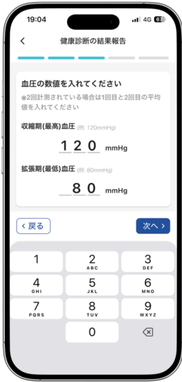
(1) Input of health checkup results